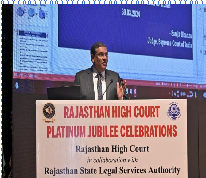
Vignettes from the Colloquium on “Legal Aid & Social Justice, Challenges & Opportunities in Access to Justice” and Rajasthan State Conference of DLSAs