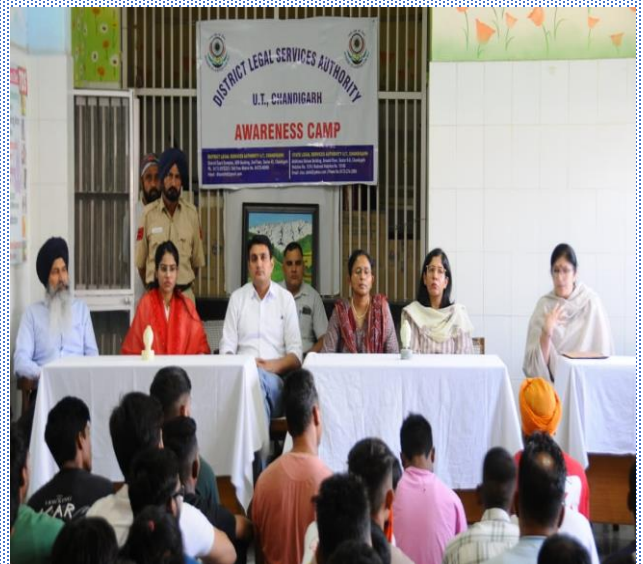
Vignette from the programme organised by DLSA Chandigarh

On 13.02.2024, DLSA, Chandigarh organized an awareness programme on “Fundamental Rights and Fundamental Duties” for the Children in Conflict with Law residing at Observation-cum-Special Home, Chandigarh. A quiz competition was also organized for the children who enthusiastically participated in the same. The winning teams were thereafter felicitated by Secretary, DLSA, Chandigarh.