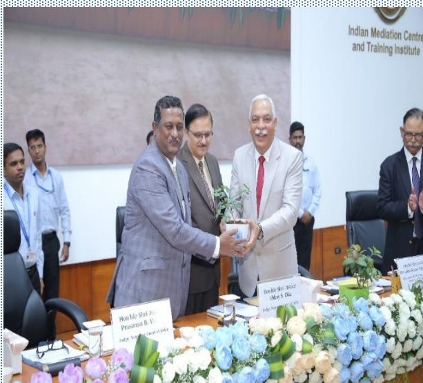
Vignette from the State Conference on Mediation at Uttan, Thane, Maharashtra

On 09.03.2024, a State Level Conference on Mediation was organized by the Maharashtra Judicial Academy in collaboration with Maharashtra SLSA at Uttan, Thane. HMJ Sanjiv Khanna, Judge, Supreme Court of India & Executive Chairman, NALSA; HMJ Abhay Oka, Judge, Supreme Court of India; and HMJ P.B. Varale, Judge, Supreme Court of India graced the occasion. The leitmotif of the deliberations was the need to develop an institutional culture for effective mediation in Courts and the need to spread awareness about the benefits of mediation.