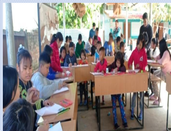
Vignettes from the programme organised by DLSA, Chandel, Manipur

On 23.02.2024, DLSA, Chandel, Manipur under aegis of Manipur State Legal Services Authority organized a One-day Legal Awareness Programme at Anallon Christian Institute Higher Secondary School, Lambung, Chandel District. During the said Awareness Programme, the participants were informed about the free legal services being provided by the Legal Services Authorities and the different schemes prepared by NALSA to help the Legal Aid Beneficiaries.