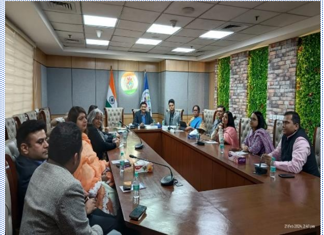
Vignette from the programme organised by Delhi State Legal Services Authority