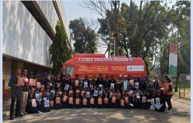
Vignette from the programme organised by DLSA, Chandigarh at Government Girls' Model Senior Secondary School

On 21.02.2024, Chandigarh SLSA organized a lecture at the Multimedia Lab, Government Girls' Model Senior Secondary School, Sector 20B, Chandigarh to spread awareness about Cyber Crimes. The Cyber Swachhata Mission Van visited the school during the said session, which was attended by around 75 students. "Think twice before sharing the information" and "Jagruk Rahe Satark Rahe" were some messages which were impressed upon the students.