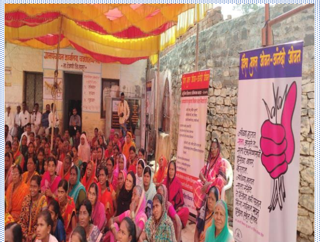
Vignette from the programme organised by DLSA, Latur, Maharashtra

On 09.02.2024, DLSA, Latur, Maharashtra, organized an Awareness Programme on topics such as “Protection of Women from Domestic Violence Act”, “Maharashtra Right to Public Services Act”, “POCSO Act” etc. at Grampanchayat Chavanhipparga. The programme received an enthusiastic response from the women residing in the area. Many women who were subjected to domestic abuse came forward to voice their grievances. Many of them were later provided legal assistance.