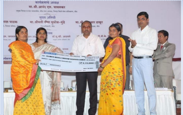
Vignettes from the programme organised by DLSA, Beed, Maharashtra