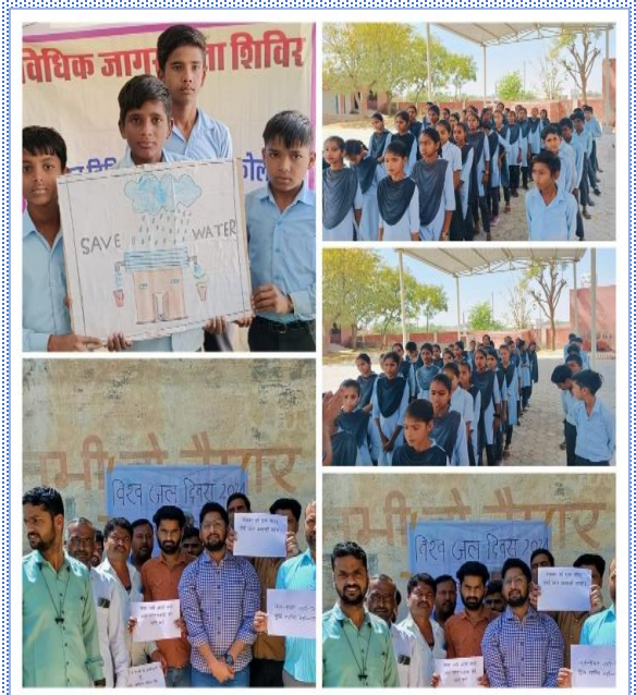
Vignette from the programmes organised by the DLSAs in Rajasthan

Water is critical for sustainable development, environmental integrity and the alleviation of poverty and hunger. Hence, to celebrate the “World Water Day” on 22 nd March, 2024, Rajasthan State Legal Services Authority directed all DLSAs to organize programs on this year’s theme ‘Water for Peace’. Accordingly, all DLSAs in Rajasthan organized Awareness Programs on this crucial theme with the help of Aanganwadi Workers, Panel Lawyers and PLVs. In these Awareness Programs emphasis was laid on the profound significance of water in our lives and its role in fostering peace and prosperity.