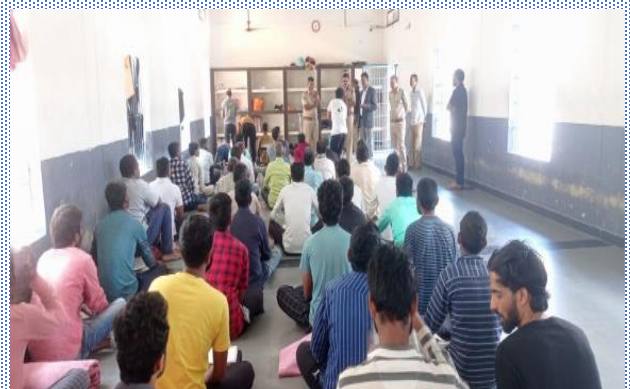
Vignette from the programme organised by DLSA, Hyderabad, Telangana

On 19.02.2024, DLSA, Chandigarh, organized a Legal Awareness programme for the Children living in the Observation- cum-Special Home, Chandigarh. The children were informed about their rights, entitlements and duties under various laws, especially JJ Act, POCSO Act and RTE Act. They were also given information about the NALSA (Child Friendly Legal Services to Children and their Protection) Scheme, 2015 and Legal Services for Differently Abled Children Scheme, 2021. The resource person address