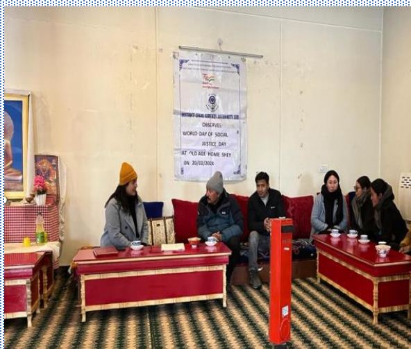
Vignette from the programme organised by DLSA, Leh

On 20.02.2024, DLSA, had organized an Awareness Programme at Old-Age Home, Shey, to celebrate the “World Day for Social Justice”. The participants were informed about the relevance of the World Day for Social Justice which seeks to initiate conversations on the need to build fairer and more equitable societies. The participants were specifically told about the rights of persons with disabilities under the Rights of Persons with Disabilities Act, 2016.