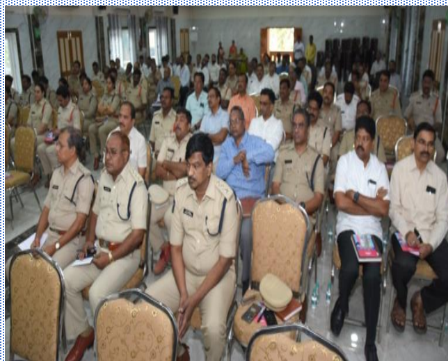
Vignettes from the training programme organised by Andhra Pradesh SLSA

On 06.02.2024, DLSA Senapati, Manipur, under the aegis of Manipur SLSA organized a Capacity Building Programme for PLVs manning the Special Legal Aid & Services Camp at Kangpokpi Court Complex, Kangpokpi District, Manipur. During the said Programme, the PLVs were told about the different NALSA Schemes for the target beneficiaries and some practical scenarios were shared with them where their intervention was desirable. The Programme was attended by around 50 PLVs.