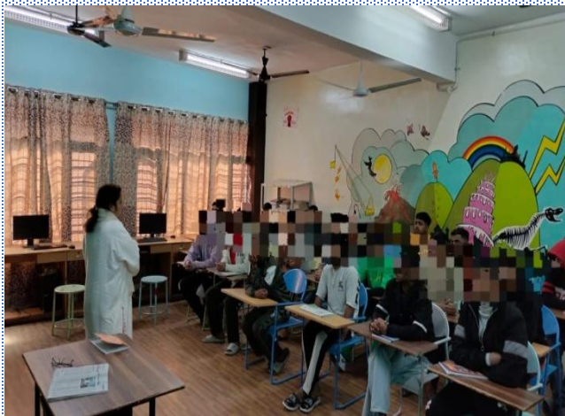
Vignette from the programme organised by Chandigarh DLSA