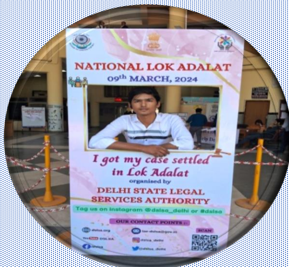
Vignettes from the 1 st National Lok Adalat for the year 2024