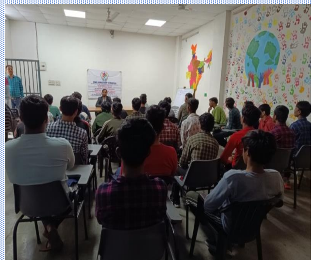
Vignettes from the programme organised by Central DLSA, Delhi

On 24.02.2024, Central DLSA, Delhi organized a Legal Awareness Program on the topic “Cyber Crimes and POCSO Act”, in compliance of directions passed by the Hon’ble High Court of Delhi in W.P.(CrL.) No. 1505/2021 titled “Mrs X vs. UOI & Ors.”, for the Children living in the Observation Home for Boys and Place of Safety at Majnu Ka Tila, Delhi.