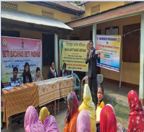
Vignette from the programme organised by DLSA Nagaon, Assam

On 05.02.2024, DLSA, Nagaon, Assam organised an Awareness Programme in Rajagaon, Raha, Nagaon, for the tribal persons residing there. In the said Awareness Programme, around 65 tribal participants were told about their rights under the Forest Rights Act, 2006; Protection of Civil Rights Act, 1955; Protection of Civil Rights Rules, 1977; and the NALSA (Protection of Tribal Rights) Scheme, 2015. They were encouraged to reach out to the DLSAs/TLSCs for resolution of any problems faced by them.