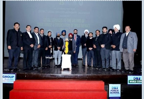
Vignette from the program organised at CITI Institute of Law

On 07.02.2024, Ld. Member Secretary, Punjab SLSA participated in a State-Level Programme organized by DLSA Jalandhar in collaboration with CITI Institute of Law and addressed the participation on the topic “Legal Services provided by the Legal Services Institutions to the Victims of Drug Abuse and initiatives taken to eradicate the drug menace”. Around 500 students attended the said programme.