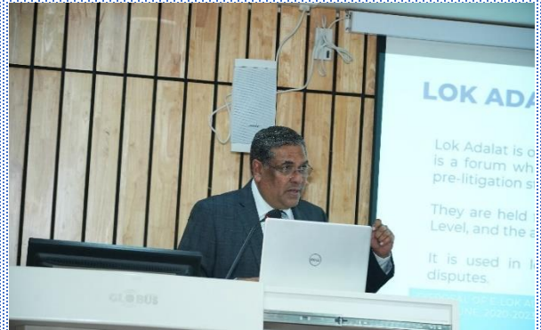
Vignettes from the Karnataka State Conference of DLSAs