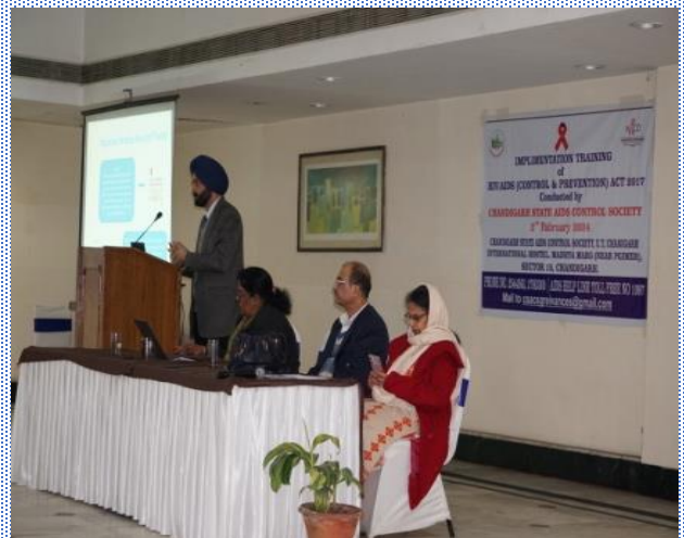
Vignette from the programme organised by DLSA, Chandigarh

The only way to make a difference in the fight against HIV-AIDS is education. On 02.02.2024, DLSA, Chandigarh organized an Awareness Programme on HIV/ AIDS (Control and Prevention) Act 2017, at Hotel Park View, Sector- 24 Chandigarh. The said programme was attended by the Complaint Officers of different NGOs and Government Departments. This programme was attended by around 50 participants .