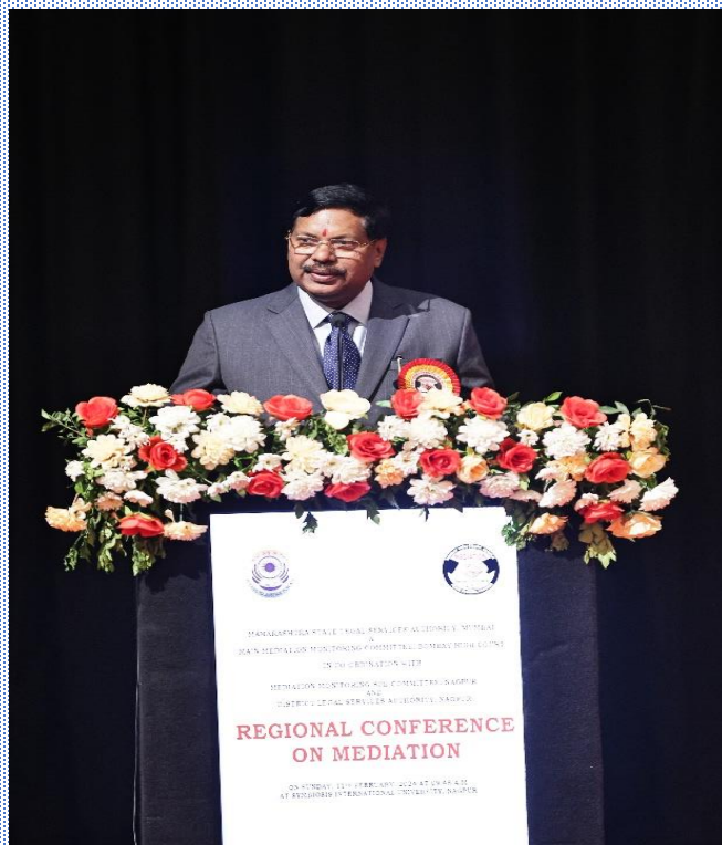
Vignette from the Regional Conference on Mediation at Nagpur, Maharashtra