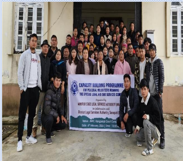
Vignette from the Capacity Building Programme for PLVs organised by Manipur SLSA

On 06.02.2024, DLSA Senapati, Manipur, under the aegis of Manipur SLSA organized a Capacity Building Programme for PLVs manning the Special Legal Aid & Services Camp at Kangpokpi Court Complex, Kangpokpi District, Manipur. During the said Programme, the PLVs were told about the different NALSA Schemes for the target beneficiaries and some practical scenarios were shared with them where their intervention was desirable. The Programme was attended by around 50 PLVs.