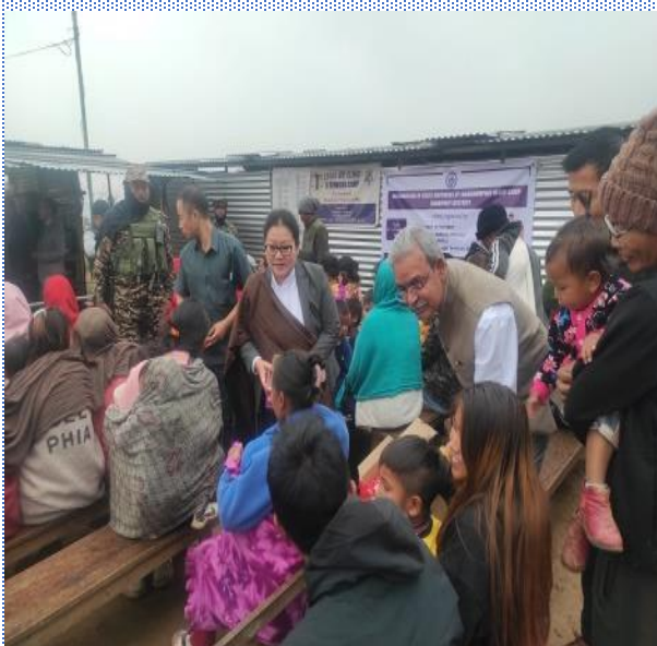
Vignette from the programme organised by Manipur SLSA

On 23.02.2024, DLSA, Chandel, Manipur under aegis of Manipur State Legal Services Authority organized a One-day Legal Awareness Programme at Anallon Christian Institute Higher Secondary School, Lambung, Chandel District. During the said Awareness Programme, the participants were informed about the free legal services being provided by the Legal Services Authorities and the different schemes prepared by NALSA to help the Legal Aid Beneficiaries.