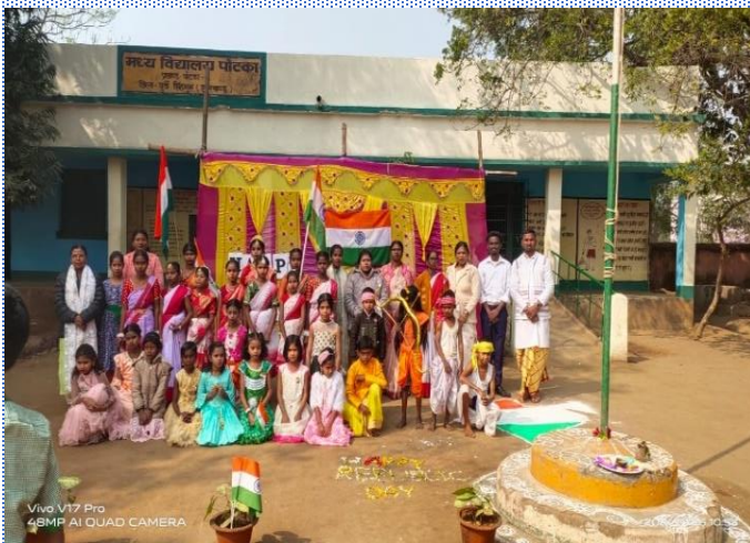
Vignette from the programme organised by DLSA, Jamshedpur, Jharkhand

On 26.01.2024, DLSA, Jamshedpur, Jharkhand organized an Awareness Campaign at Middle School Potka, East Singbhum on the topic ‘Fundamental Rights and Fundamental Duties’, ‘POCSO Act’, ‘Right to Education Act’ etc. Around 149 students attended the program, which was very well received by the inquisitive and impressionable young minds..