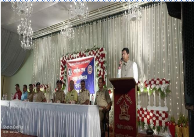
Vignette from the programme organised by DLSA, Kolhapur, Maharashtra

On 21.02.2024, DLSA, Kolhapur, Maharashtra, organised an Awareness Programme on topics such as “Road Safety, Traffic Signs”; “Right to Information Act, 2005” and “Maharashtra Right to Public Services Act, 2015”. The program was held at Dairyaprasad Hall, Tarabai Park, Kolhapur and saw a large participation from the public. Around 400 persons attended the programme.