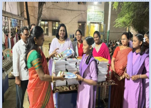
Vignette from the programme organised by DLSA, Ananthapuramu, Andhra Pradesh

On 09.02.24-11.02.24, the Chandigarh SLSA in collaboration with DLSA, Chandigarh and Legal Aid Society of Department of Law, Punjab University, Chandigarh set up a Legal Aid stall at the venue of the Annual Rose Festival. By way of the Legal Aid stall, the people attending the Rose Festival were informed about the different kinds of Legal Services being provided to the intended Legal Aid Beneficiaries. Volunteers from the Department of Law, Punjab University also offered their services during the Legal Aid camp and informed the public about the benefits of ADR, the apps developed by the National Legal Services Authority etc.