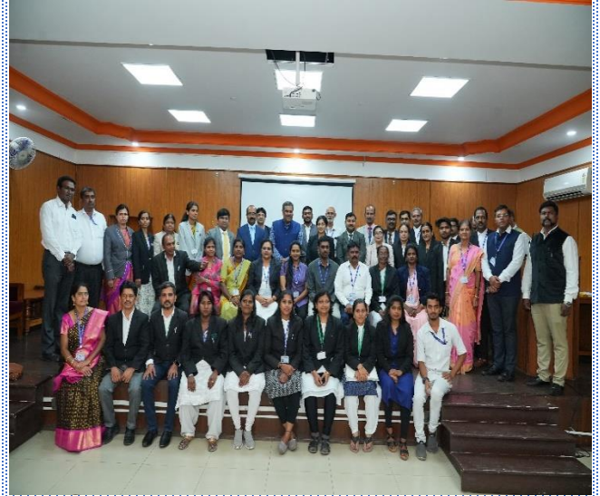
Vignettes from the visit of HMI Sanjiv Khanna to Karnataka for the State Conference of DLSAs