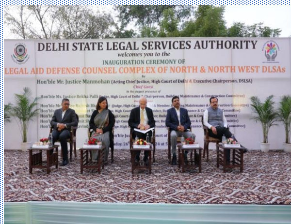
Vignettes from the programme organised by Delhi State Legal Services Authority