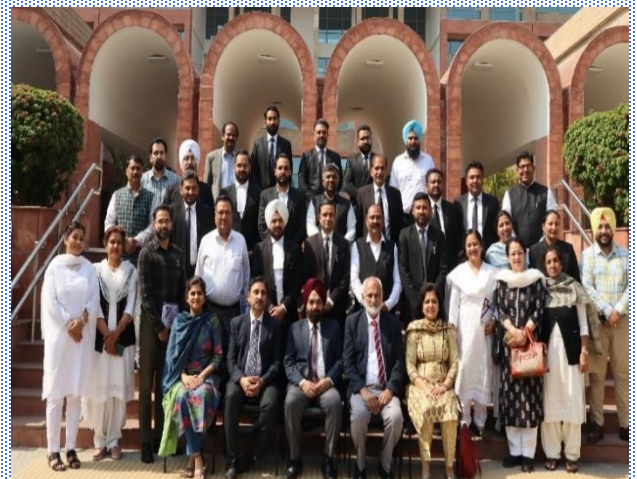
Vignettes from the Mediation Training programme organised by Punjab State Legal Services Authority

From 18.03.2024 till 22.03.2024, Punjab SLSA organised a 40-hours mediation training program at the Chandigarh Judicial Academy for the judicial officers and advocates. This training offered them unique opportunities to develop and master the analytic and practical skills of good judging and lawyering, where resolution of disputes is sought to be done in the most amicable, and non-combative manner. It was well received by the judicial officers and lawyers, who felt that the Mediation Training added to the repertoire of their skills making them better and more seasoned legal professionals.