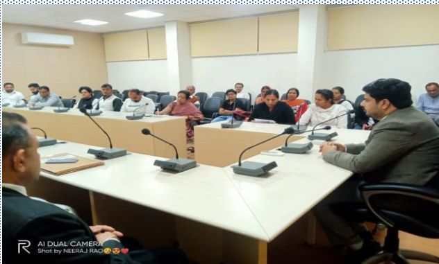
Vignettes from the programme organised by DLSA Ambala, Haryana

On 30.03.2024 and 31.03.2024, DLSA Ambala organized a training programme for the Legal Aid Defence Counsels posted in the Courts of Ambala, Kurukshetra, Kaithal and Yamuna Nagar. Topics of relevance in a criminal trial, such as “Art of Cross-Examination; Forensic and Electronic Evidence; Art of making final arguments; general defences and special defences in criminal law” etc. were covered.