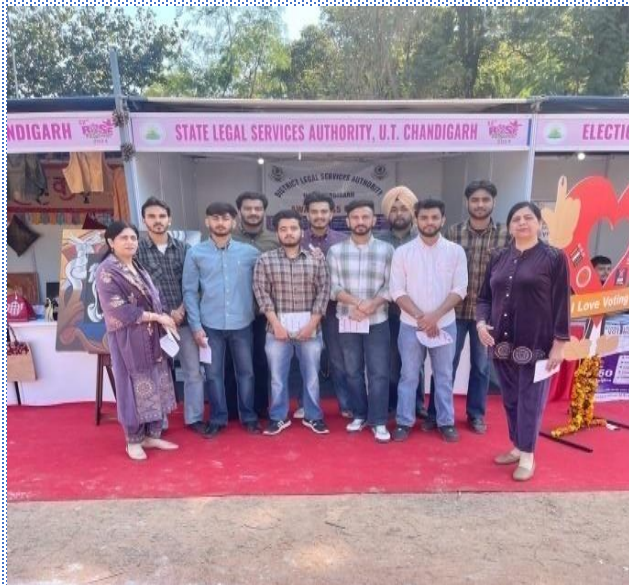
Vignette from the programme organised by Chandigarh State Legal Services Authority

On 02.01.2024, Secretary, DLSA, Ananthapuramu, Andhra Pradesh visited the B.C. Welfare Hostel and Social Welfare Hostel for Girls at Ananthapuramu. She distributed books to the students residing there and addressed the students. She apprised them about different Constitutional and Statutory Provisions meant to safeguard and promote the rights of children. Special emphasis was laid on the provisions of the POCSO Act, Right to Education Act, The Prohibition of Child Marriage Act etc.