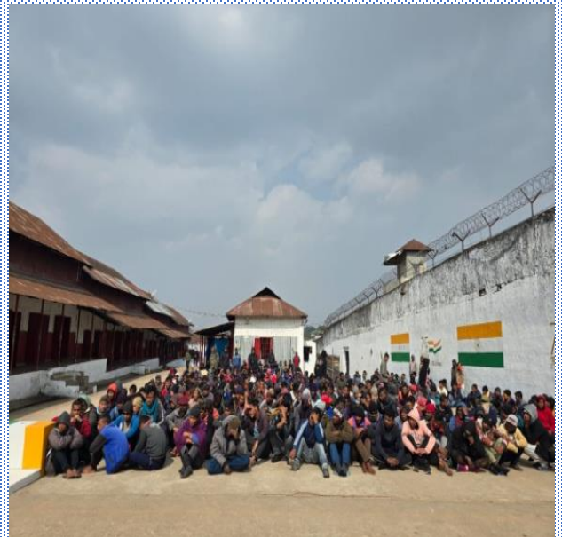
Vignette from the programme organised by Meghalaya SLSA

In the darkness of prison, the light of education can guide the way to redemption. To provide that opportunity of redemption, on 28.02.2024, the Secretary, DLSA, Hyderabad visited the Central Prison, Chanchalguda, Hyderabad and addressed the inmates on various topics. He spoke about the rehabilitative avenues for the inmates and encouraged them to learn new skills.